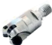
Twister 04 pag. F 52