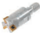
Twister 11 pag. F 54