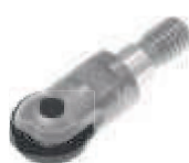
Twister 06 pag. F 53