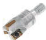
Twister 01 pag. F 50