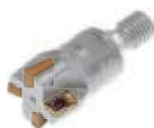
Twister 03 pag. F 51