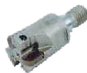
Twister 31 pag. F 56