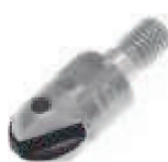
Twister 16 pag. F 55